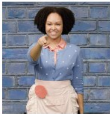
so that you