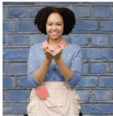
"These are written