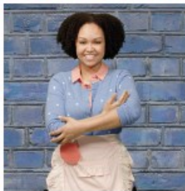
the Son of God.