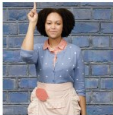
that Jesus is the Christ,